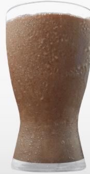
CHOCOLATE SHAKEOLOGY® 16oz. with ice and water