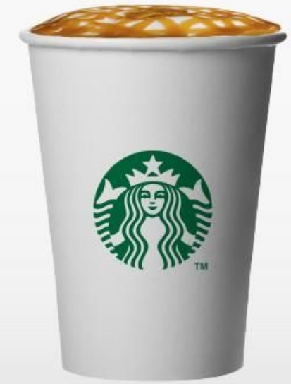
STARBUCKS® CARAMEL MACCHIATO* 16oz. with whole milk